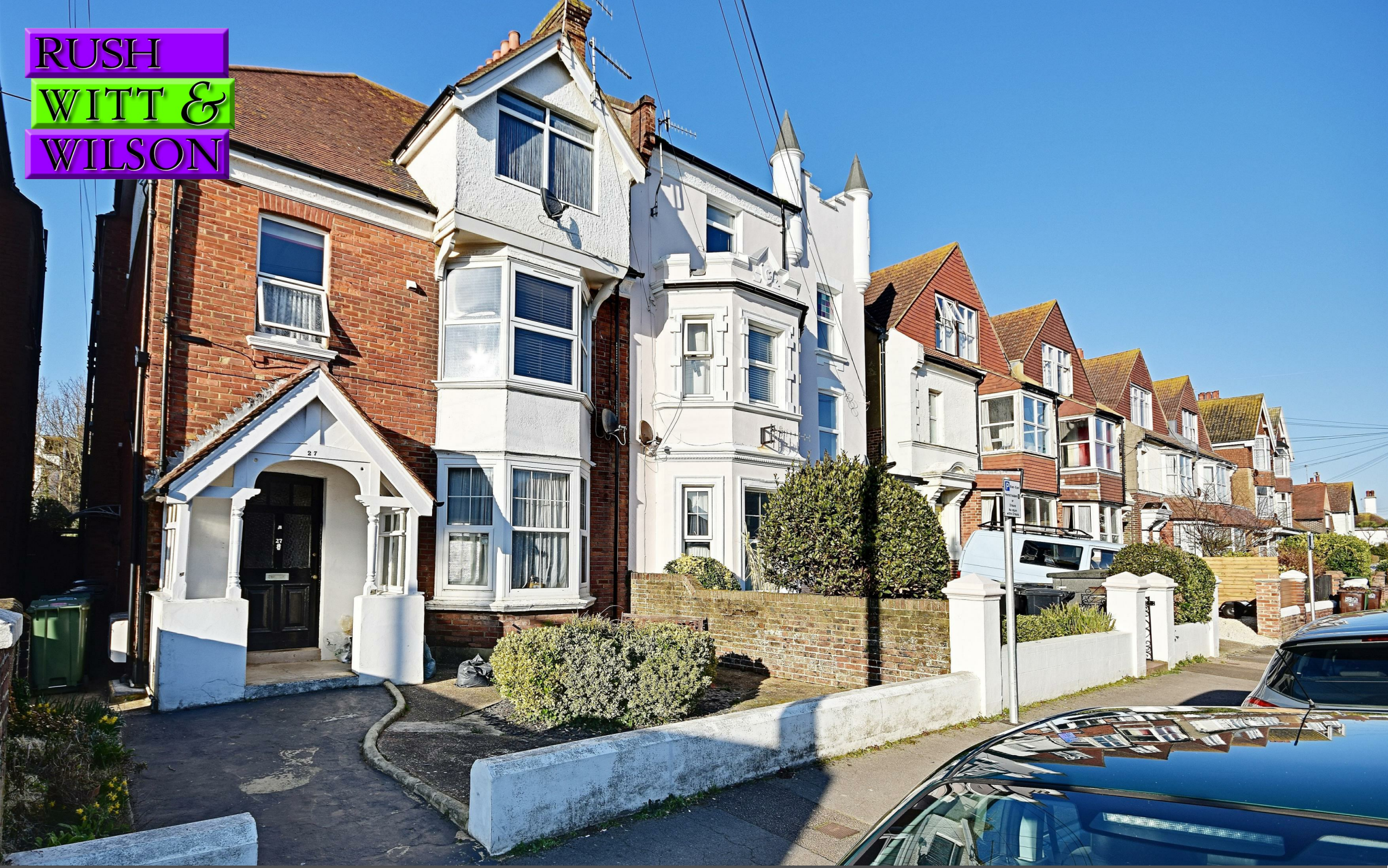
Flat 2, 27 Jameson Road, Bexhill-On-Sea, East Sussex TN40 1EG £230,000